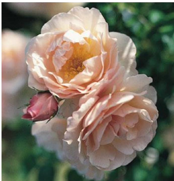
(Left) 'Fighting Temaire' – 2011 Should be available in the U.S. in 2013