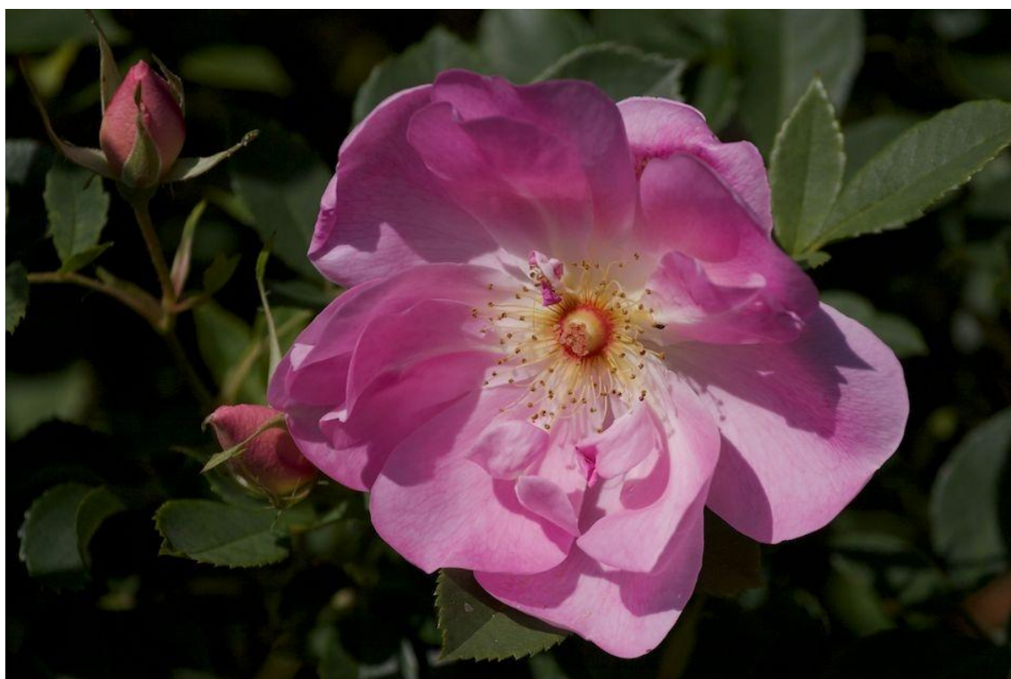
(Left) 'The Lady's Blush' - 2010