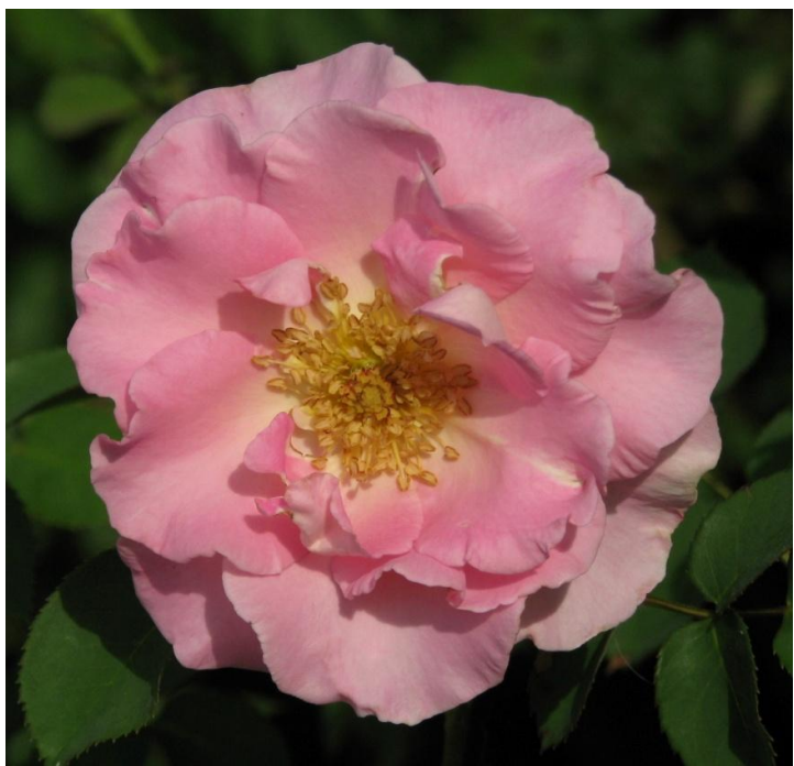
(Above) 'Marinette' - 1997