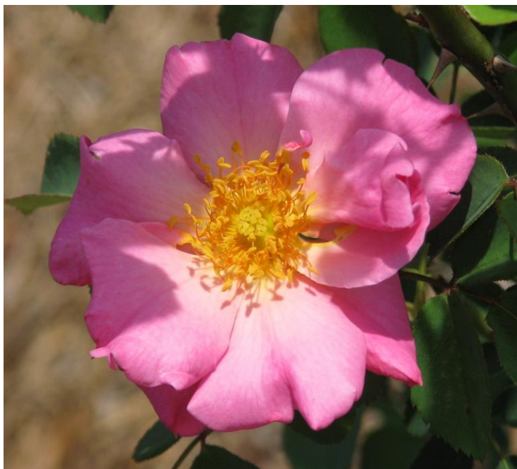
(Left) 'Sir Clough' - 1983