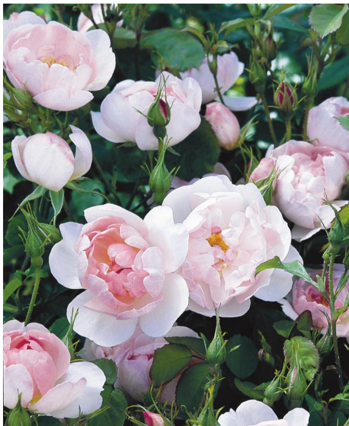
(Below) 'Scarborough Fair' - 2003