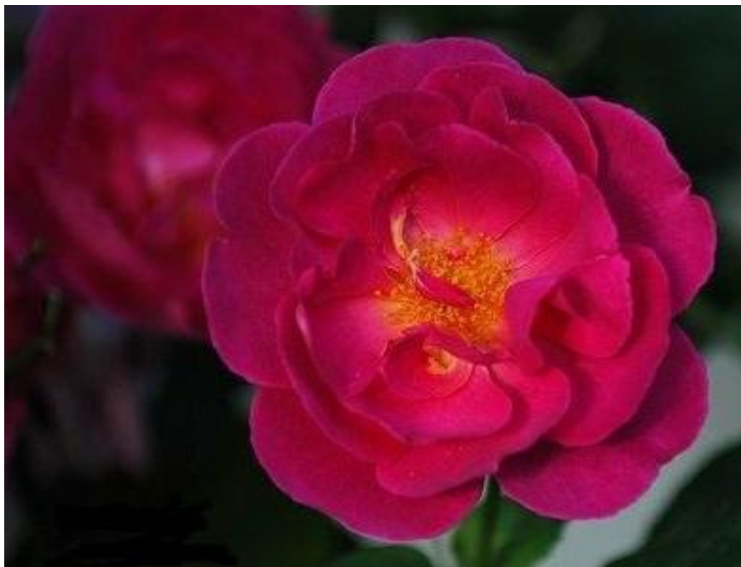
(Left) 'The Herbalist' - 1994