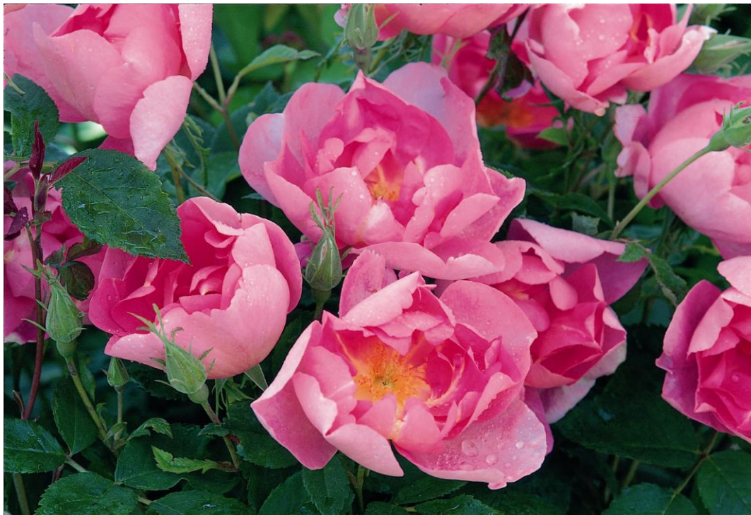
(Left) 'Fighting Temaire' – 2011 Should be available in the U.S. in 2013