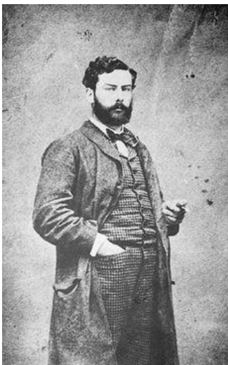
Alfred Sisley: The Rose and The Painter