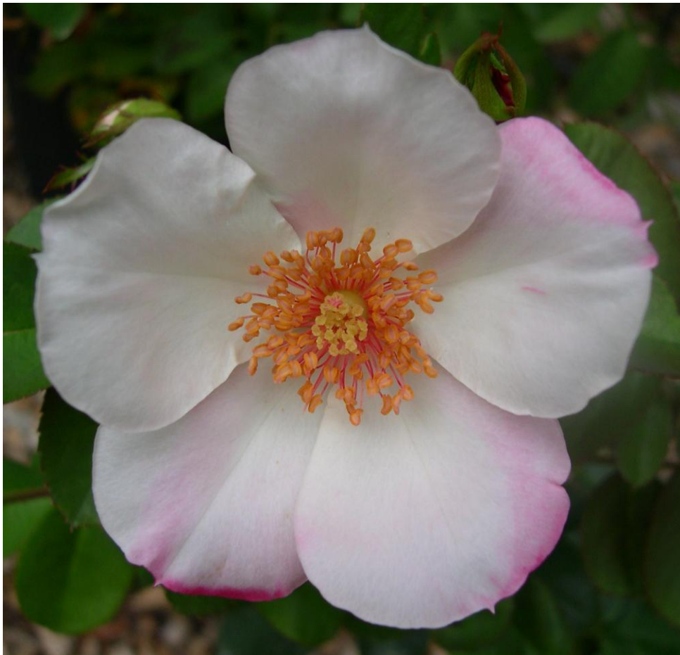
Occhi di Fata: Photo Courtesy of Bill Patterson

"O beautiful fairy eyes So deep and strange, You have stolen The peace of my youth."