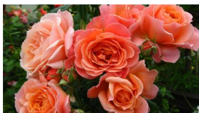
Loretta Lynn Van Lear. From the Biltmore Garden Rose Collection

The scents of fall are finally coming in with the evening breezes here in the foothills of the Blue Ridge Mountains. The air is a little bit crisper, leaves are showing hints of golden hues to come and the sky is just that different shade of blue.