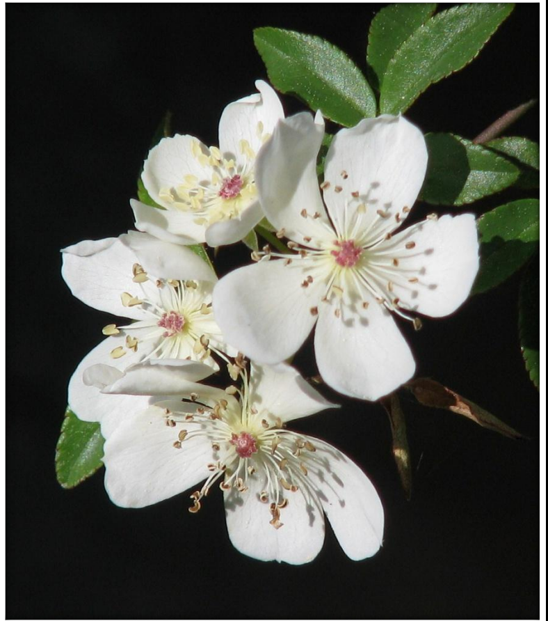
R. banksiae normalis

By the first decade of the twentieth century documented accounts show the rose was being cultivated