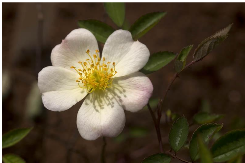
Left – ‘Frier’ x ‘Mutabilis’ Simon Voorwinde

An attempt by Simon to recreate the Louis Lens hybrids ‘Plaisanterie’ and ‘Apricot Bells,’ unavailable to Australian rose growers.