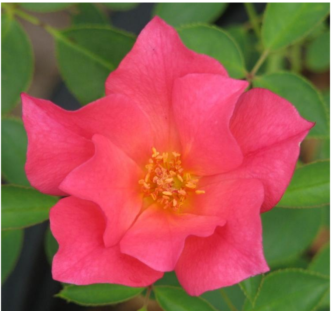
Below – ‘Lila Banks’ seedling