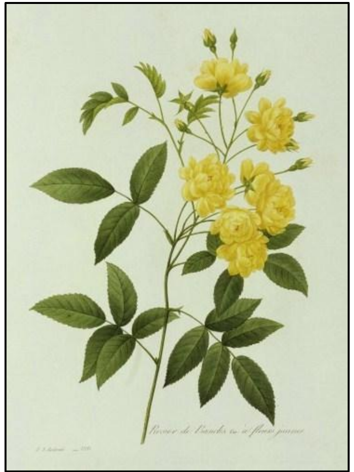
Above – R. banksiae lutea (Rosier de Bancks var. a fleurs jaunes – Redoute)