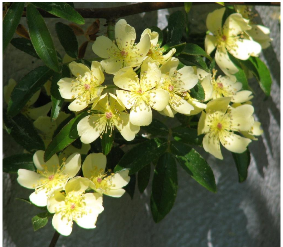
Below – R. banksiae lutescens