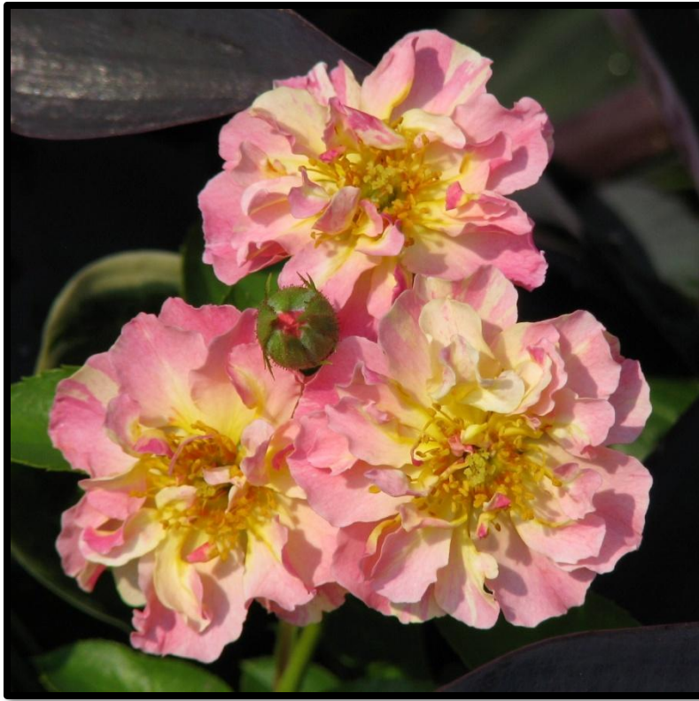
Unnamed 'Lyda Rose' seedling (one of mine!)