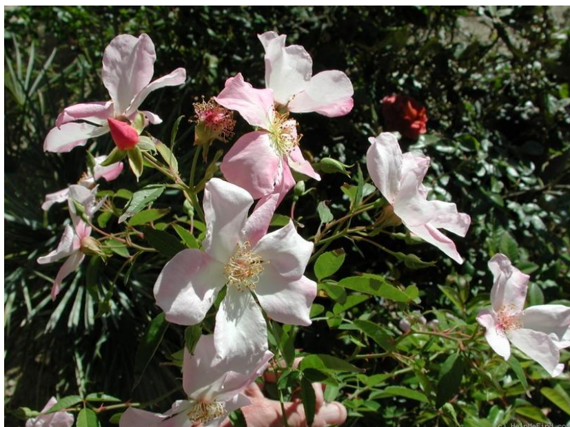
Left – ‘Rayon ButterFed’