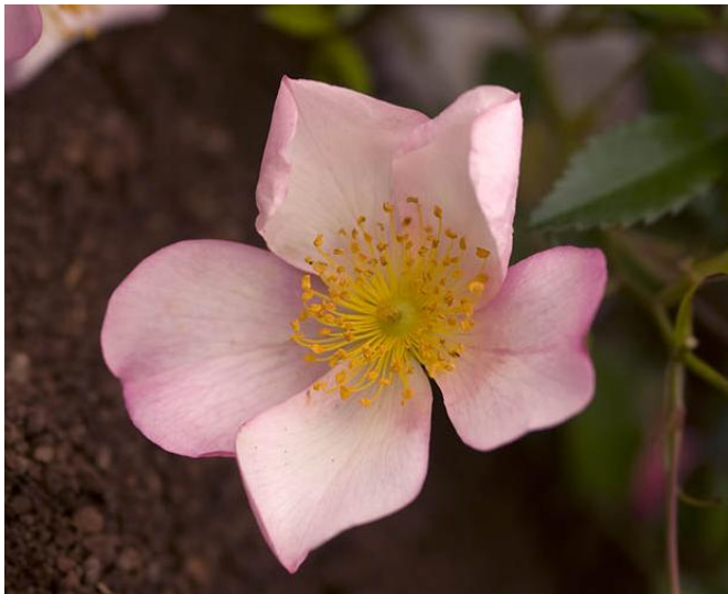
Bottom – 'Willow' ('Temple Bells' x 'Mutabilis') Australian hybridizer Simon Voorwinde Very low growing, trailing habit