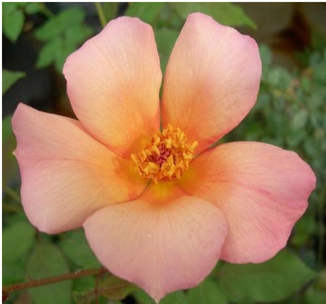
Above left – ‘Riverbanks’

A glance at the Rose Hybridizers Forum will show that a handful of hybridizers have some interest in working with R. banksiae , particularly the single yellow lutescens . The dramatic beauty of all four forms and their resistance to black spot continue to inspire.