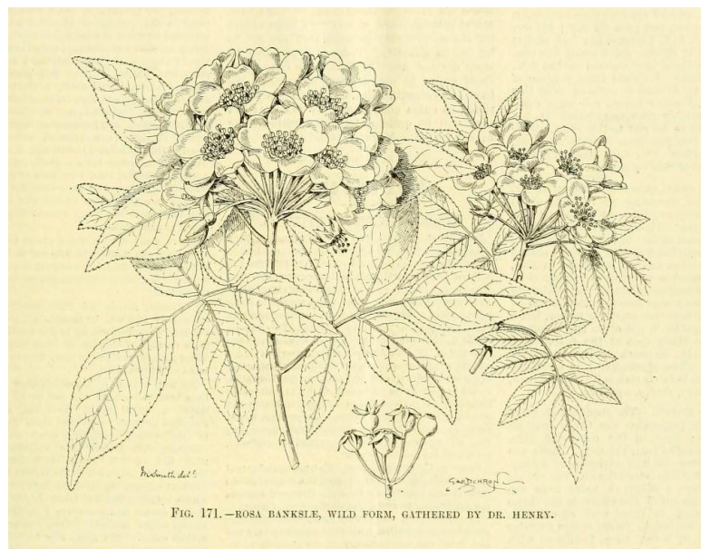
FIG. 171.—ROSA BANKSIAE, WILD FORM, GATHERED BY DR. HENRY.

"Rosa Banksia, Wild Form, Gathered by Dr. Henry" Gardener's Chronicle , Vol. 31, 1902, p. 439.