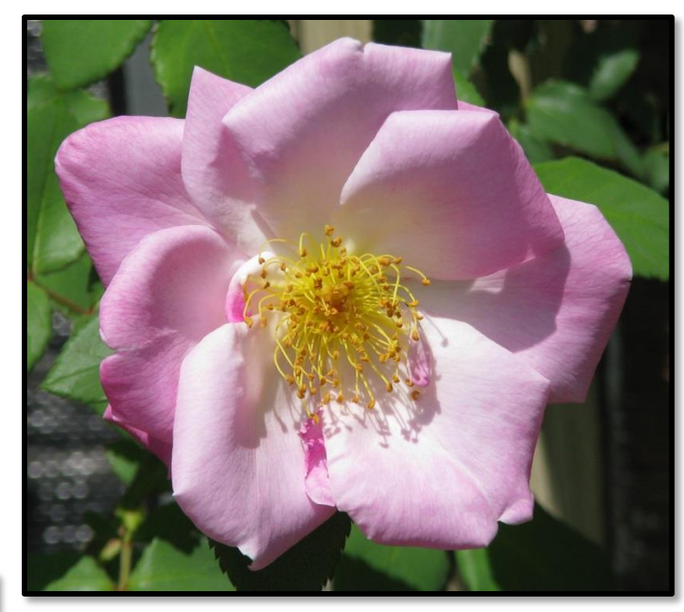
'Purple Splash' – Large-flowered Climber, 2010 Photo unattributed