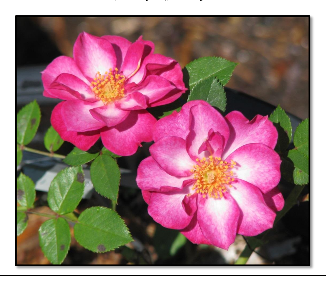
'Make Believe' – Miniature, 1986