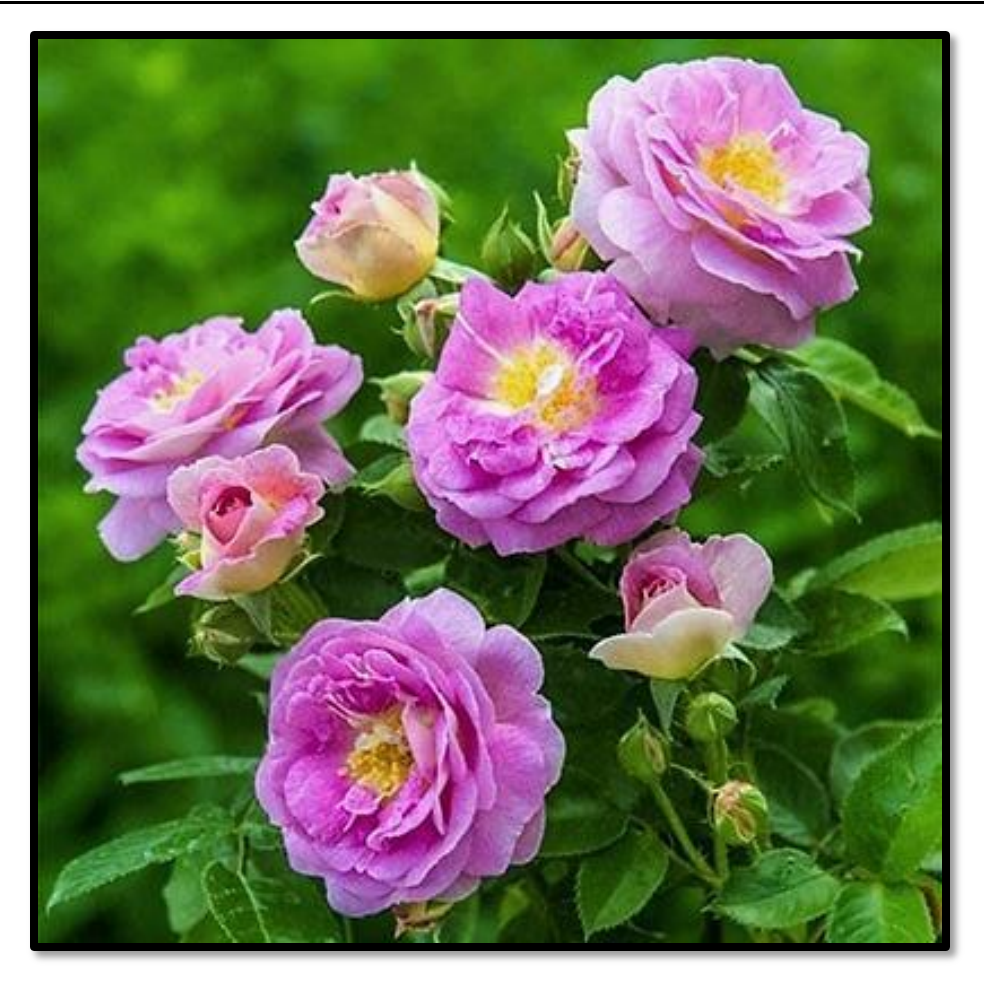
'Arctic Blue'