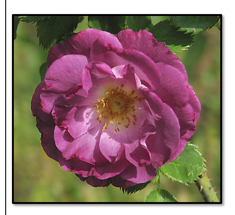
'Blue For You' – Floribunda, 2006