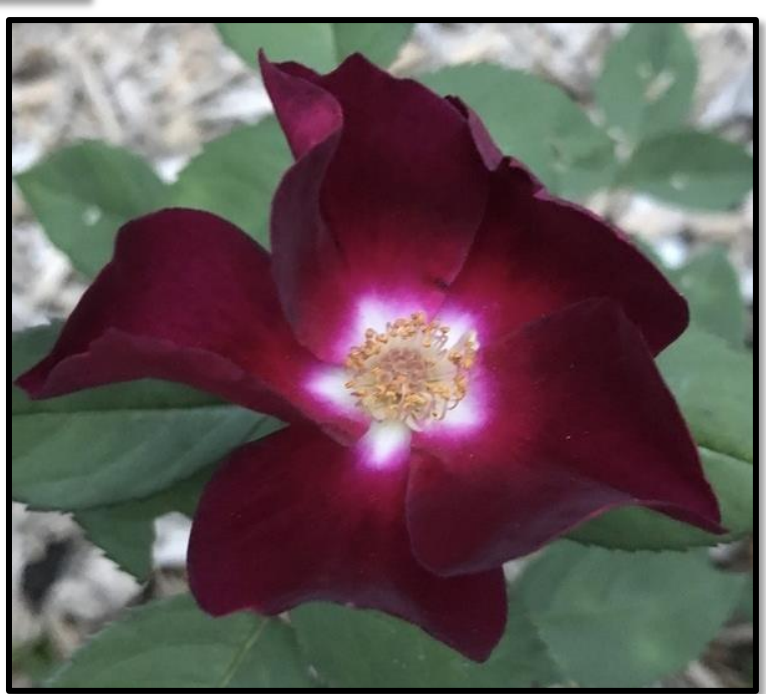
'Tight My Night' – Climber/Shrub, 2013