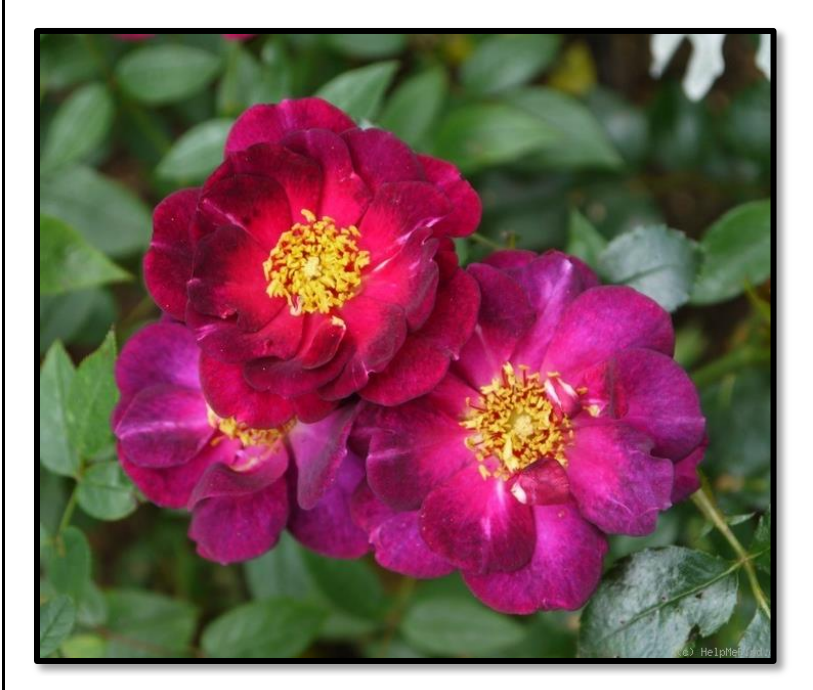
'Blue Peter' – Miniature, 1983, De Ruiter