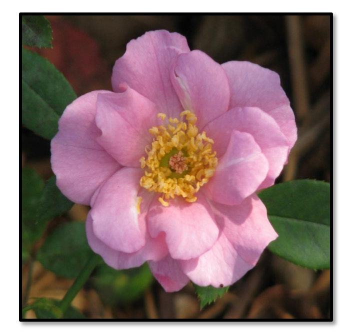
'Angel Darling' – Miniature, 1976

In 1968 the team of Herb Swim and Ollie Weeks produced one of the most popular lavender to purple Floribundas – 'Angel Face.' Like 'Lilac Charm' much of its coloration can be attributed to 'Lavender Pinocchio' and 'Sterling Silver.' It has inspired many – both growers and hybridizing enthusiasts – seven generations are listed on HelpMeFindRoses.com including the next group of Miniatures and Floribundas.