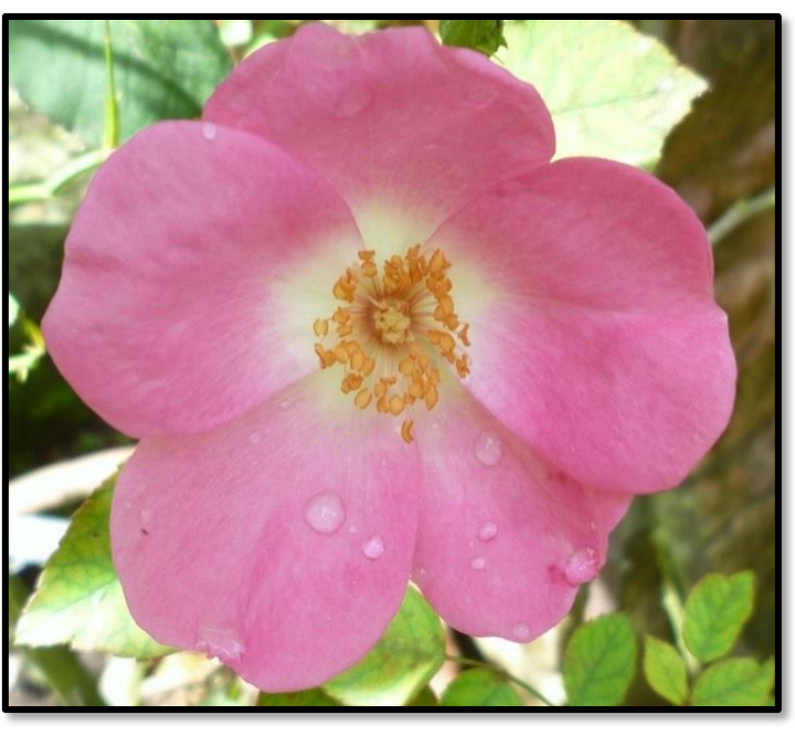
'Rose Tegend' (Akira Ogawa) – the first recurrent seedling out of a new Japanese R. laevigata sport; pink to lilac; Photo by Viru Viraraghaven