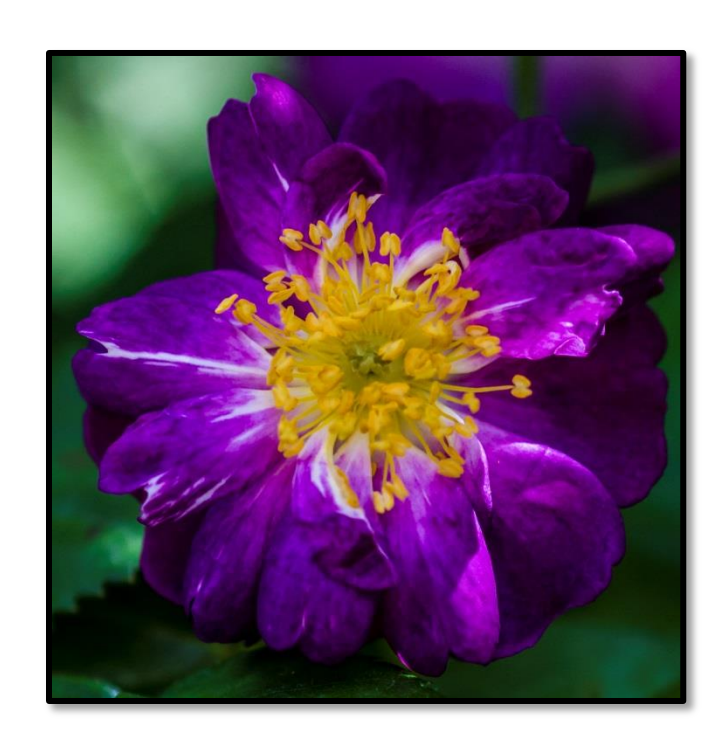
'Veilchenblau' Hybrid Multiflora, 1909