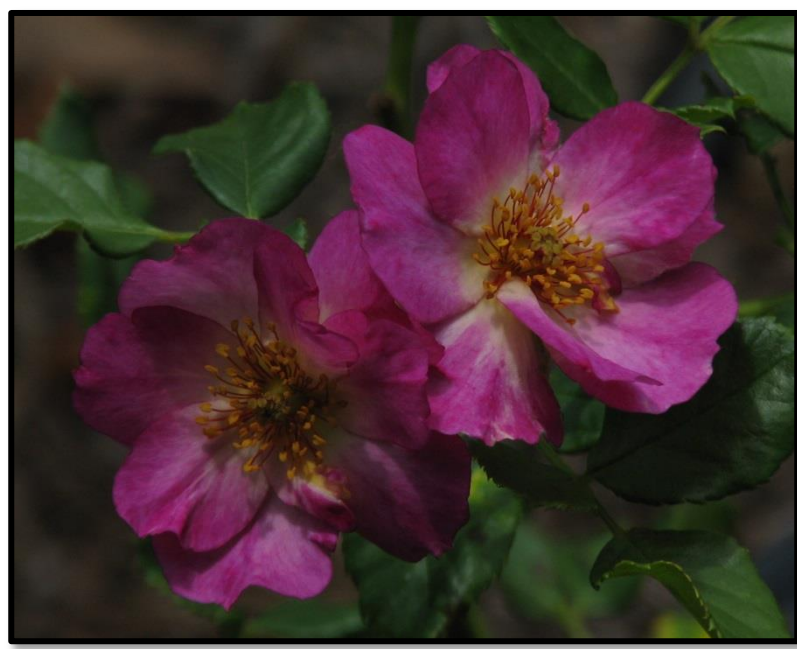
'Puppy Kisses' – Floribunda, 2011