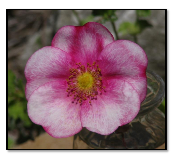
'Mary Conway' – Spinosissima seedling from rose at left; 2015