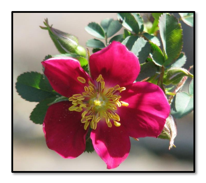
'Doorenbos Selection' Hybrid Spinosissima, ca. 1950