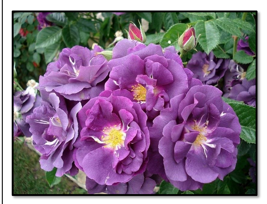
'Rhapsody In Blue' – Shrub, 2000

As mentioned at the beginning of this feature the introduction of Frank Cowlishaw's 'Rhapsody in Blue' in 2000 resulted in an explosion of rose hybridizing. It involved a complex hybrid involving 'International Herald Tribune,' 'Blue Moon,' 'Montezuma,' and 'La Belle Sultane,' crossed with a little-known Kordes climber 'Summer Wine.' The latter was used to produce several additional mauve-tinted cultivars that have become quite popular.