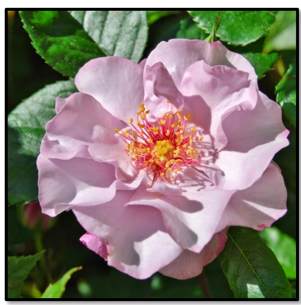
'Odyssey' – Floribunda, 2001