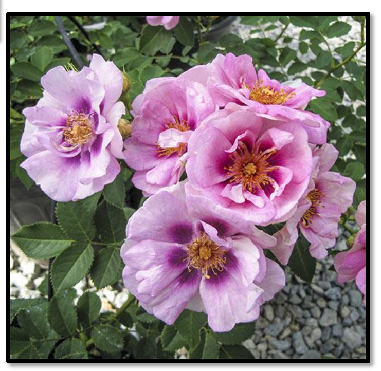
'Easy On The Eyes' – Shrub, 2016