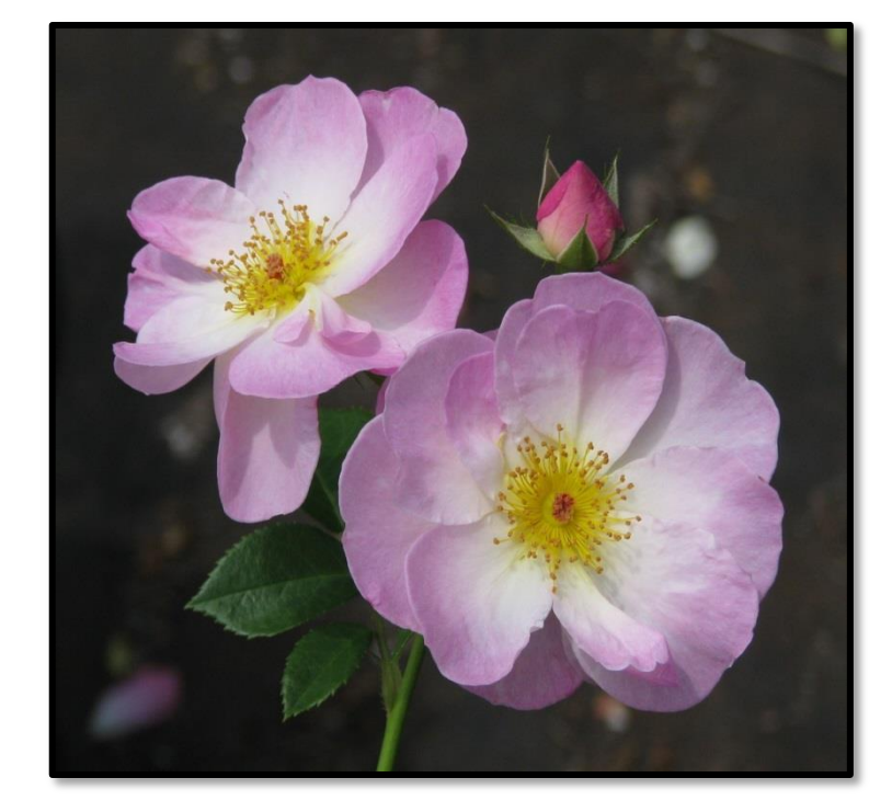
'Escapade' – Floribunda out of 'Baby Faurax,' 1967