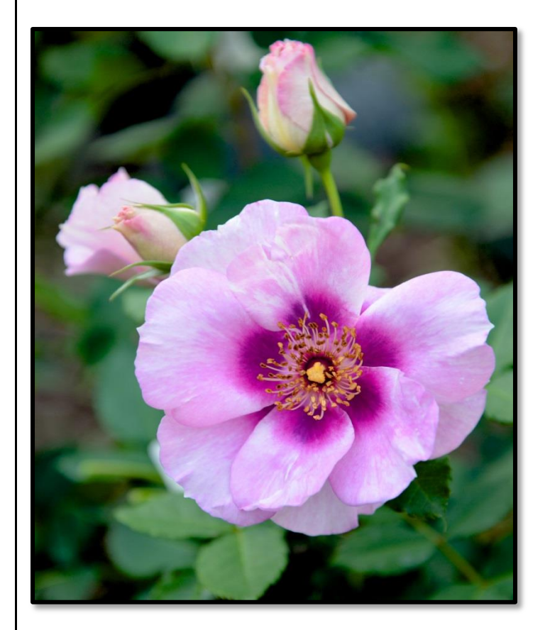
'Eyes For You' – Floribunda, 2009