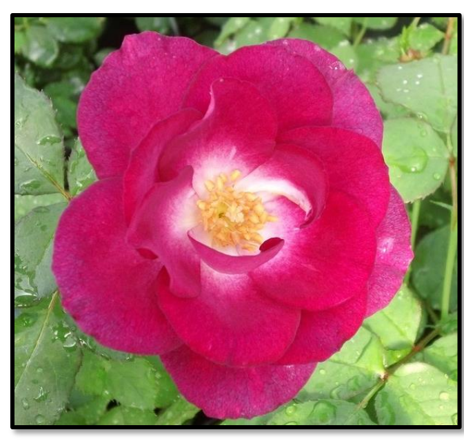
'Plum Frost' – Shrub, 2007