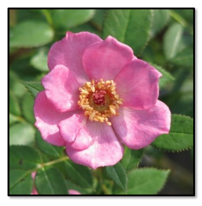
'Lavender Simplex' – Miniature, 1984