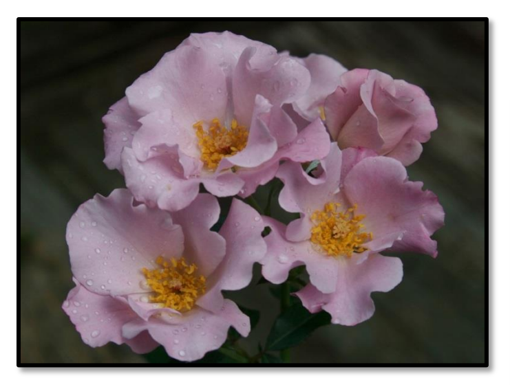
'Charlotte Ann' – Floribunda, 1993