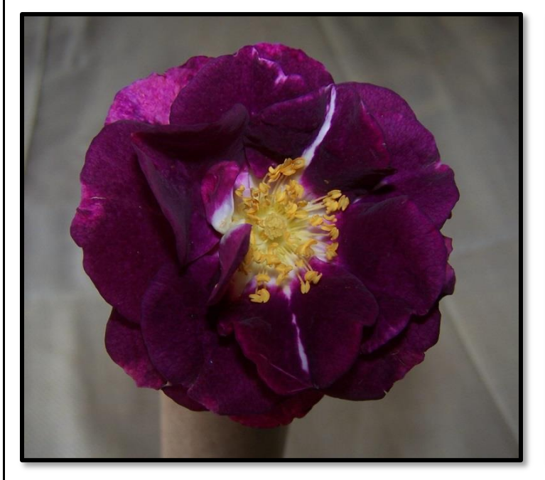
VIRpeacock — an unreleased seedling out of 'Rhapsody in Blue'