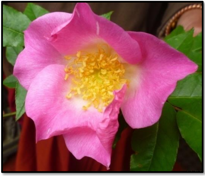
'Mia Grondahl' – Hyb. Gigantea, < 2014