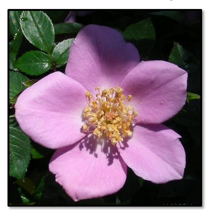
'Lavender Spoon' – Miniature bred from rose at left, 1995