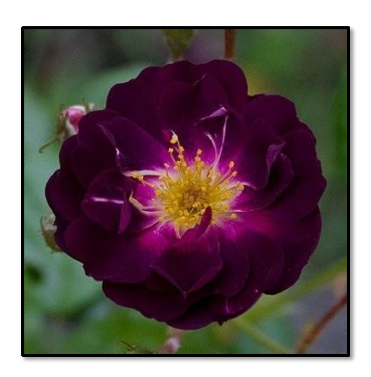
"Violette" Hybrid Multiflora from rose at left, 1921