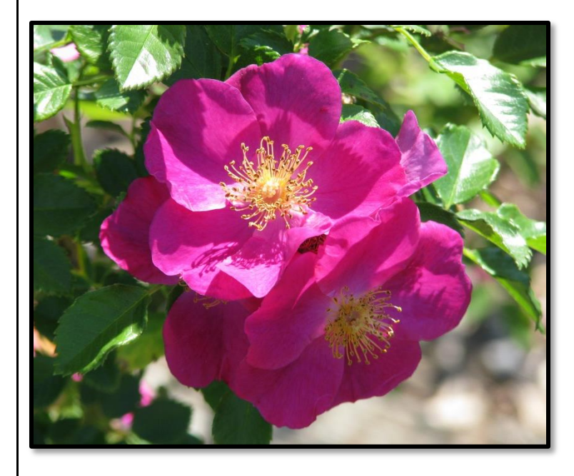
'Manhattan Blue' – Floribunda, 1990

The following group of roses is a miscellaneous one, including a broad spectrum of classes.