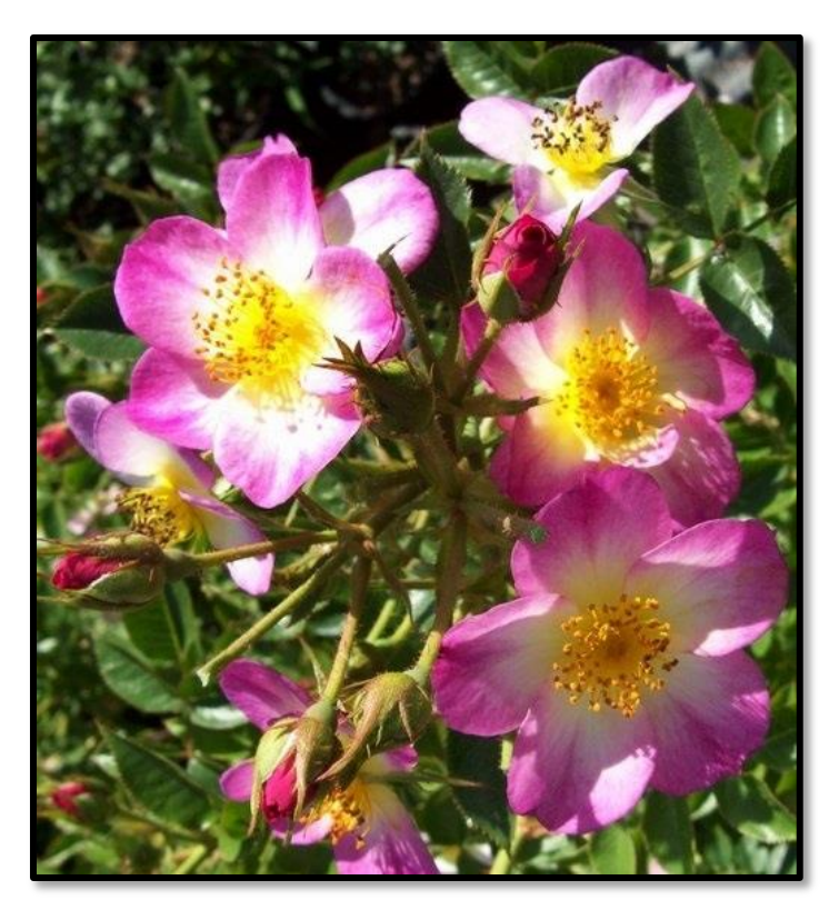
'Brindabella Gem' – Shrub, 2010

'Stormy Weather' – Targe-Flowered Climber, 2010