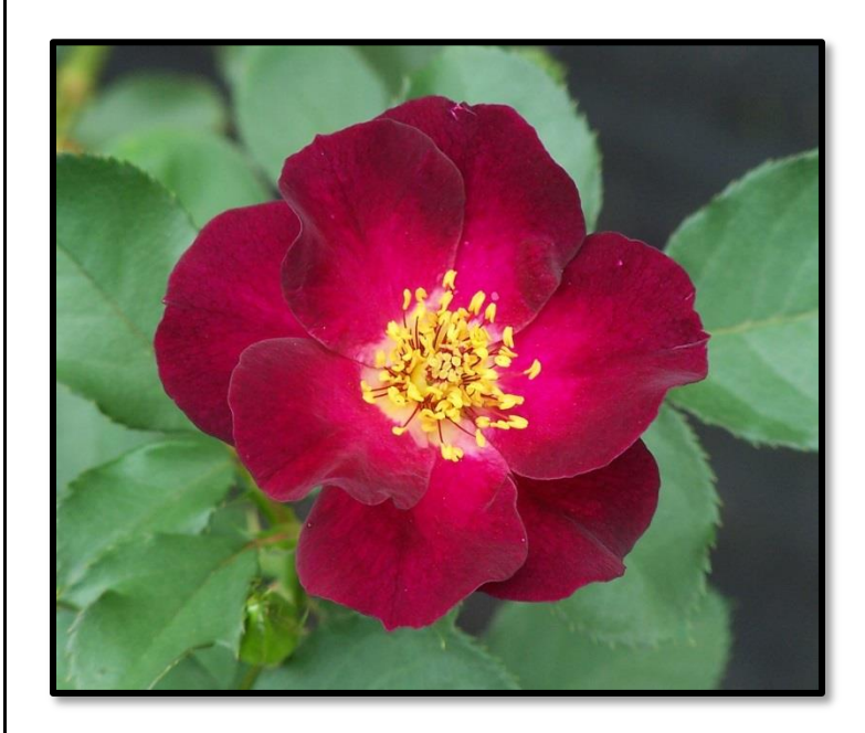
'Route 66' — Shrub, 2001

Tom Carruth's work with several complex hybrids involving 'Sweet Chariot,' 'International Herald Tribune,' and a host of other "blue" roses has resulted in a varied and extensive family tree. In addition to Tom's contributions numerous hybridizers, both professional and amateur have jumped on the purple bandwagon. Here are some of the single or semi-double varieties.