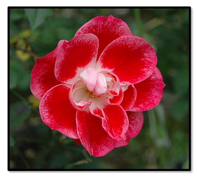
'Picasso' - Fl