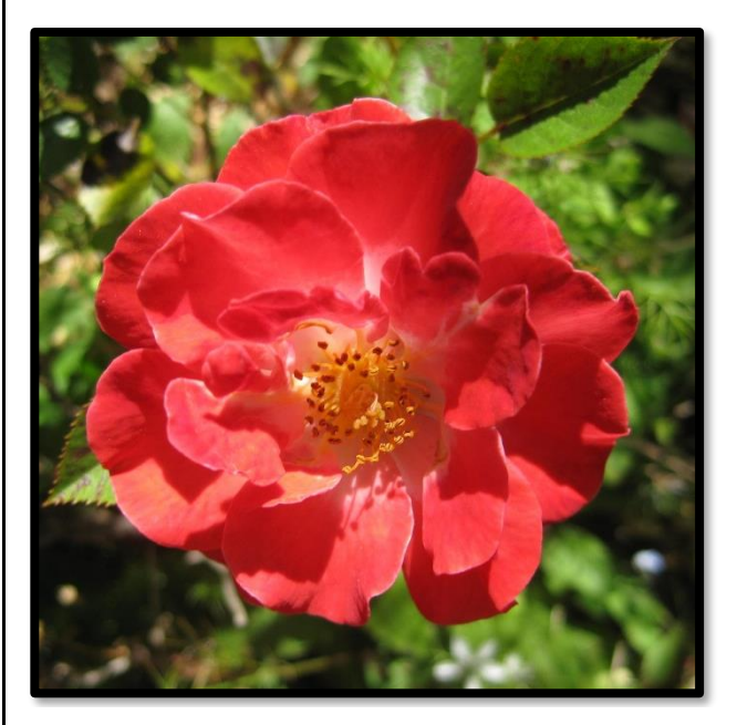
'Ragtime' - Min