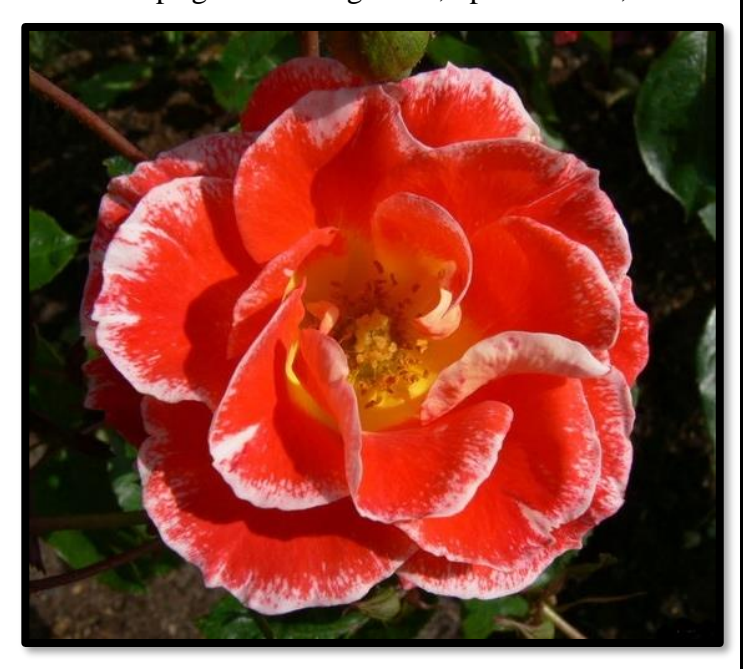
'Stretch Johnson' - FI