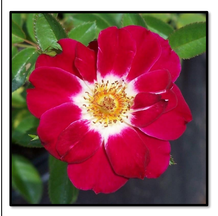
'Redhot' - Fl