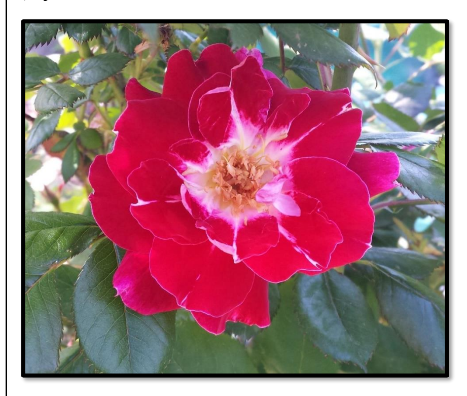
'Old Master' - Fl