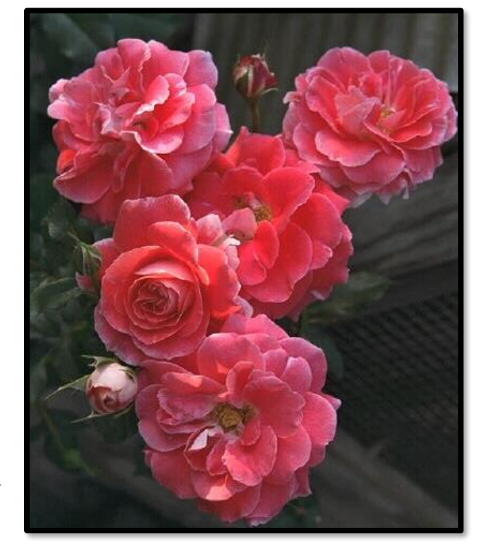
'Matangi' - FI; Photo unattributed

vigorous seedling featuring bright orange flowers with a prominent yellow eye, codenamed MACyeleye, and 'Picasso.' Its twenty or so petals are fiery vermillion or coral orange, depending on the weather, with narrow margins of white, a white center, and a startling white reverse. One early reviewer noted that it stood out like a neon sign in the garden. Its name came from a native folk song Sam heard performed by Maori operatic bass/baritone Inia Te Wiata. After moving to New Zealand, he discovered Matangi was also the name of a nearby village. From Maori to English the word is translated "gentle breeze." 'Matangi' was Sam's first important New Zealand introduction, winning not only a prestigious Certificate of Merit in New Zealand rose trials, but also the President's International Trophy in the U.K., gold medals in Rome and Bagatelle, and awards in Baden-Baden and Belfast.