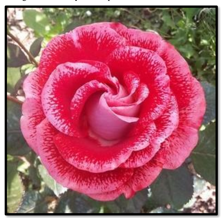
'Maestro' - HJ

rose, then known as MACspash (<u>SPA</u>nish <u>SH</u>awl), was "just right." A good deal of pressure was applied to hastily release it despite reservations on his part. It was given the name 'Sue Lawley' after a prominent British television personality and won the Gold Star of the Pacific award in New Zealand. Reportedly difficult to propagate and somewhat prone to black spot, this is probably another rose for the collector or the rose grower living in a relatively black spot free climate