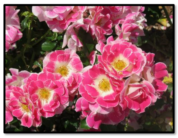
'Picotee' - Patio; Hyb by Rob Somerfield