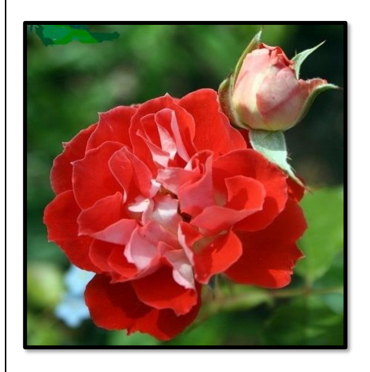
'Blastoff' - Fl; Hyb. by Ralph Moore