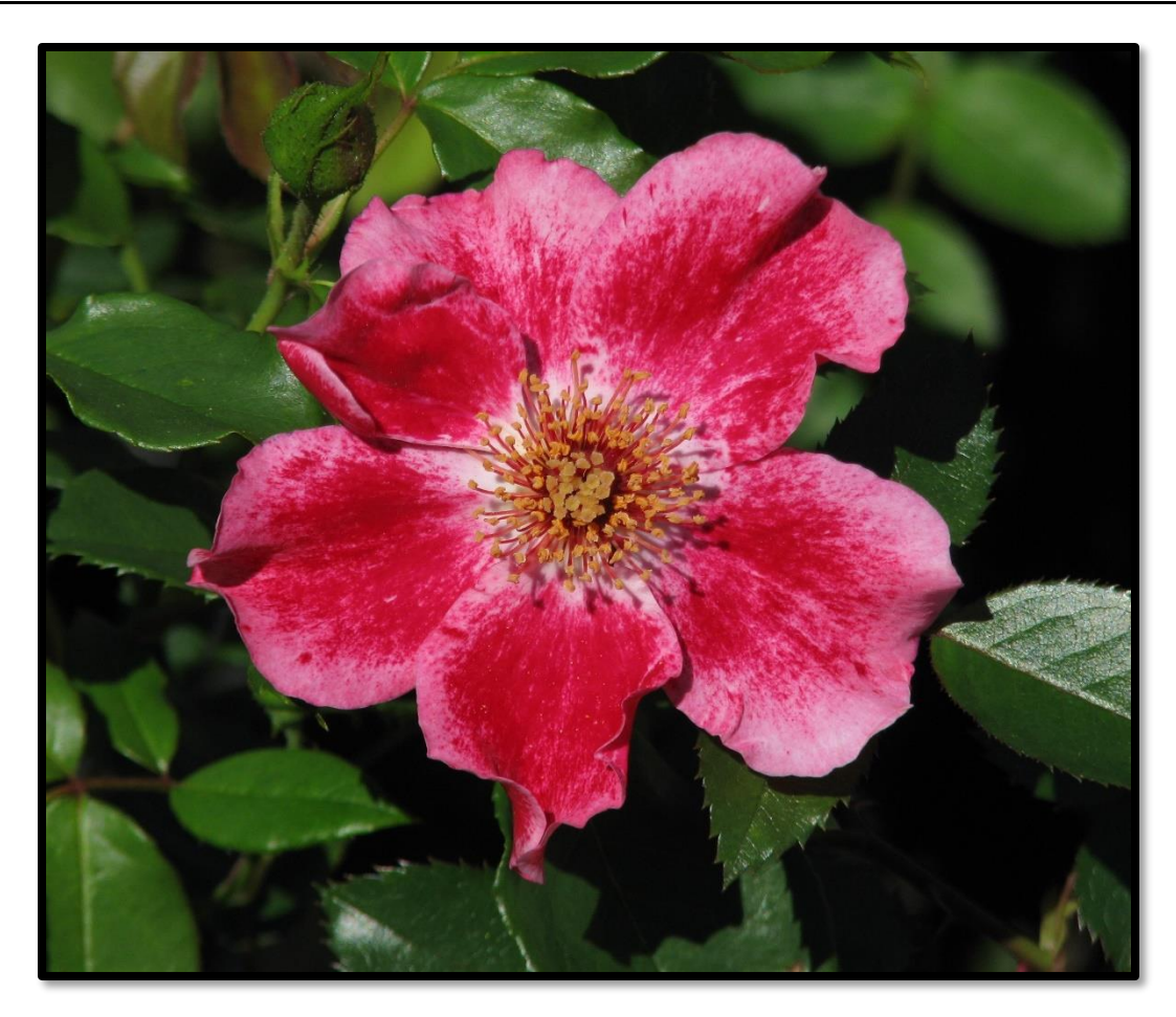
'Starberry' - Shrub