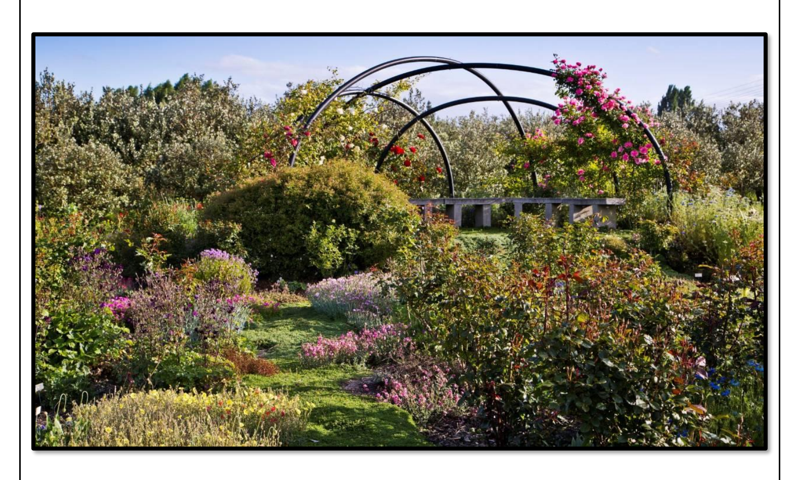
Cheops Garden, Hastings, New Zealand