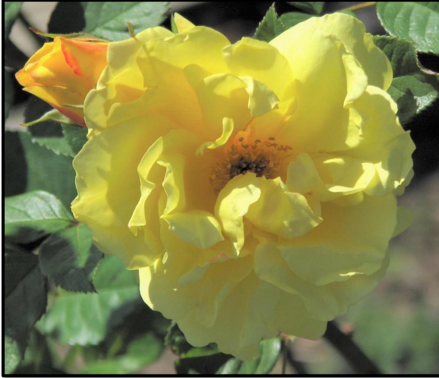
'Lemon Meringue'