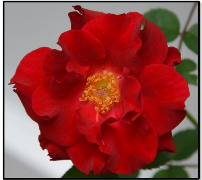
'Rhapsody In Red'

Couldn't resist the reference to the 1982 Pointer Sisters hit!