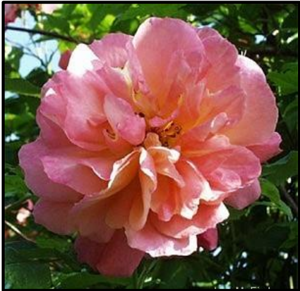
Above: 'Steinacher Gold'