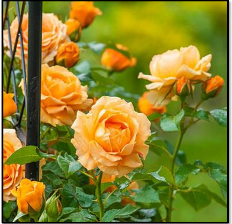
'Golden Opportunity'