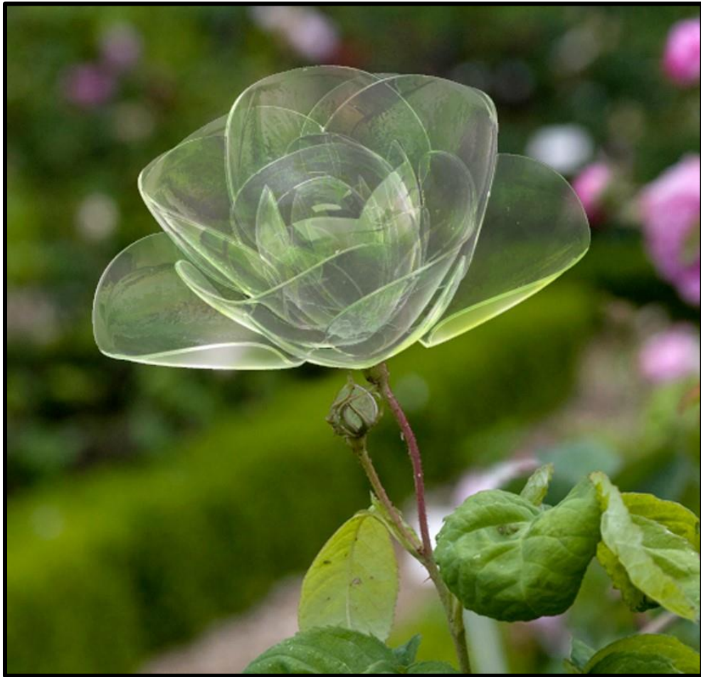
'La Reve Crystal' (see sources for more info)