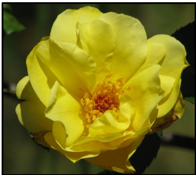
Below Right: 'Excite' x 'Paul Ecke, Jr' Rose and photo by Al Whitcomb