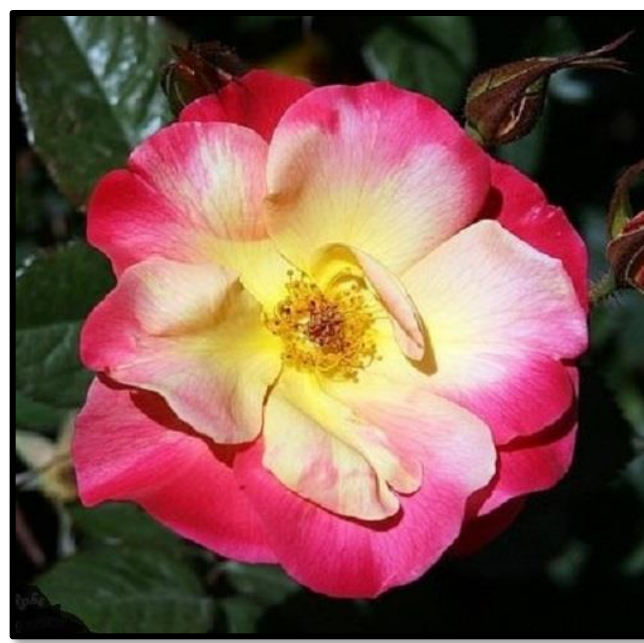
Top: 'Apricot Drift' Bottom: 'Autumn Sunset'