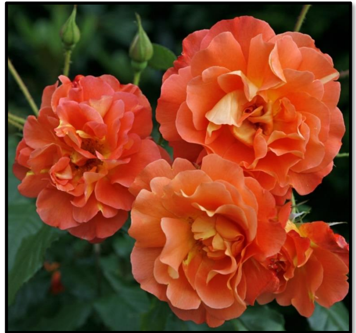
‘Westerland’ by Kordes Roses

‘Westerland’ has been used quite a bit in numerous breeding programs [Ed. note; it appears in several of the newer, very popular yellow and apricot