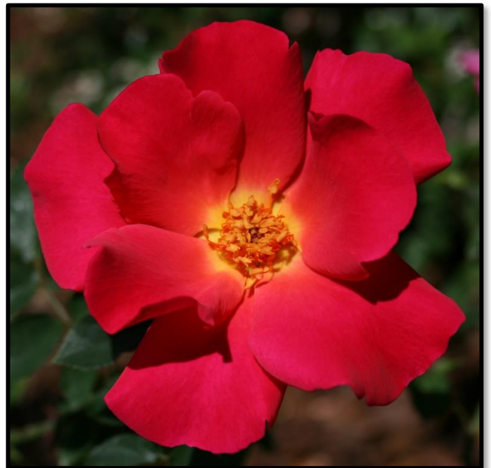
'Excite'